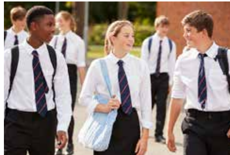
Choosing subjects in Year 8 and 9