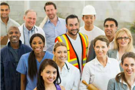
Getting a Job