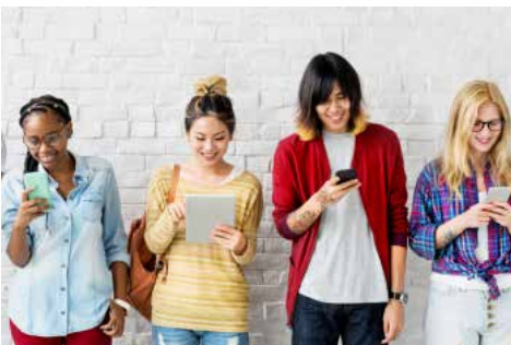
Options at 16