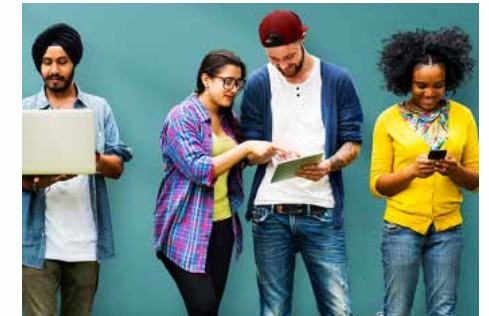
Choosing subjects and courses at 18