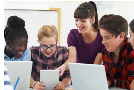
Choosing subjects and courses at 16