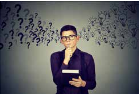
How to choose the right subject or course