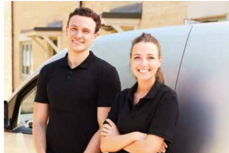
Getting into Self-employment