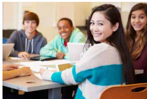
Options at 18